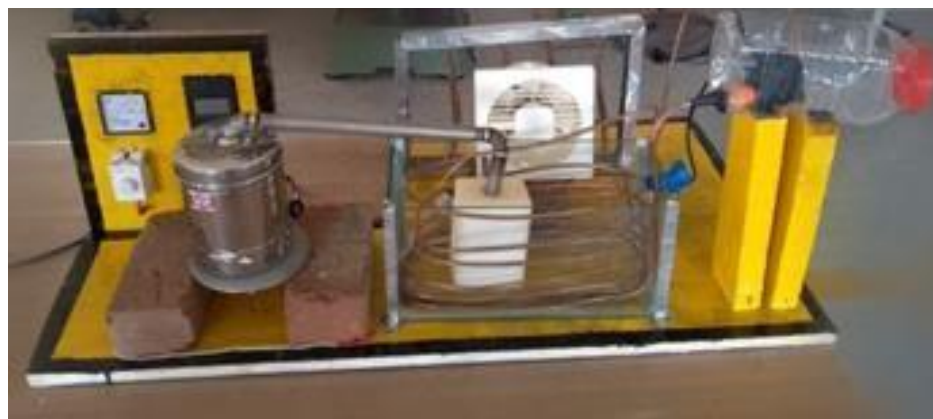
Fig2. Experimental Setup