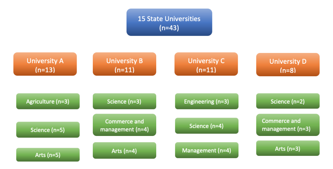
Figure 1. Distribution of clusters among universities and faculties

of an unintended pregnancy which scored 0 for "didn't consider", "didn't attempt" and "not applicable" and scored 3 for "attempted". Item no.10 and 11 assessed paying sexual favour for financial and other benefits whereas item no.12 looked into finding sexual partners using a mobile app or the internet. Item 13 and 14 considered sending and receiving sexting, the next two items were regarding taking videos of sexual activities and the final two items were Sexual transmitted Disease-related questions. All these items were assessed on a 5-point Likert scale and scored 0 for "never" and "not applicable" to 4 for "more than 3 times"