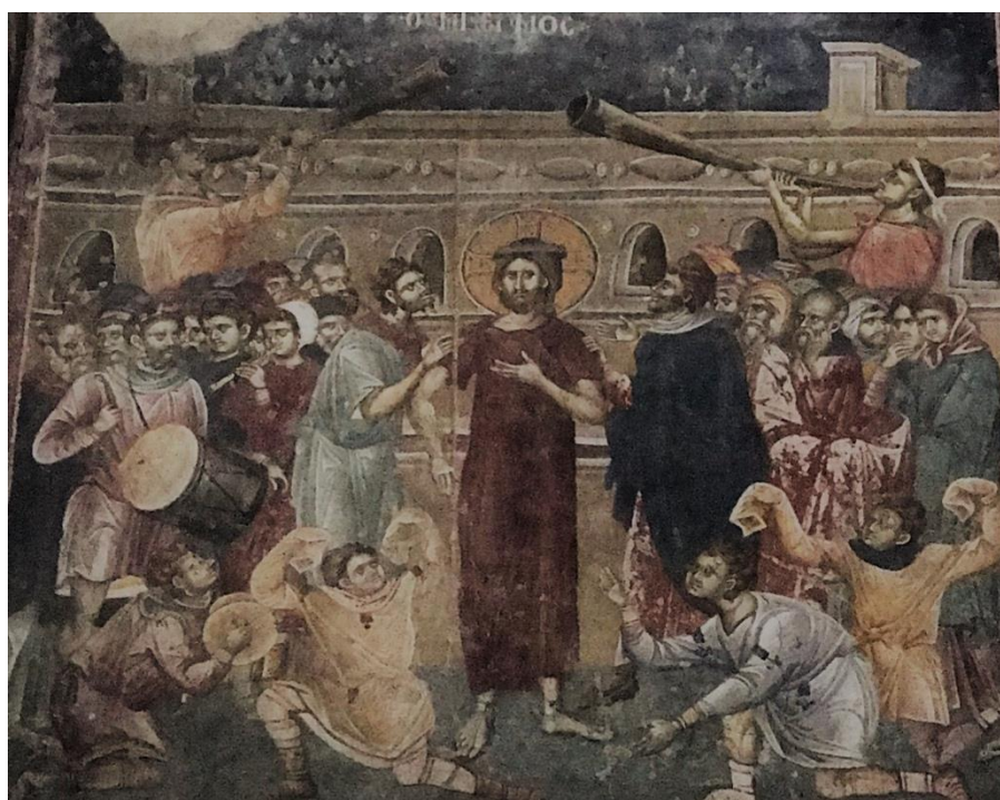
Figure 1 "Mocking Christ", Church of St. George in Staro Nagorichane, Kumanovo, Macedonia.