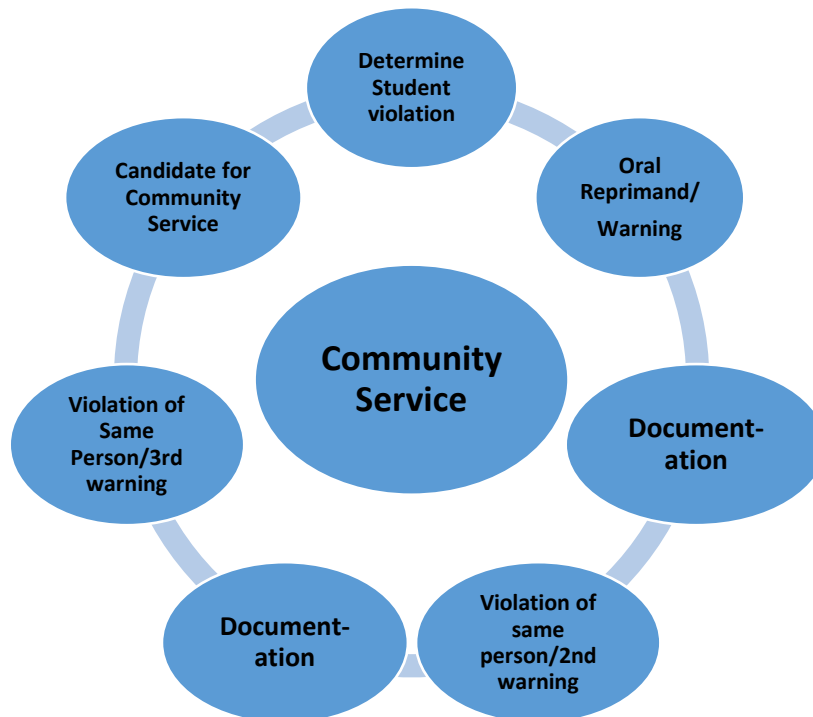
Figure 2. Intervention Process for Community Service at EAC-Cavite

Because of the study, the author has come up with descriptions of its planning and implementation activities, communication, new practices, accomplishments, as well as lessons learned in the overall process. Moreover, on the study conducted by Luiselli (2005), described the effects of a whole-school positive behavior on school discipline issues and academic results of students [14]. This is in collaboration with the teachers that in it really turned out to have decreased discipline problem after the intervention process. Green (2009) and Luiselli Putnam, and Sunderland (2002) have unique ways to address the discipline problems in their respective schools [9, 11]. Both have an intervention process to resolve the discipline problems; however, Luiselli's study is found to be more appropriate to the teaching and learning process because it correlated much to the teacher's improvement in terms of improved instructional methods and classroom activity engagements. Furthermore, Castolo (2007) also affirmed that handling discipline has many approaches to deal with most especially